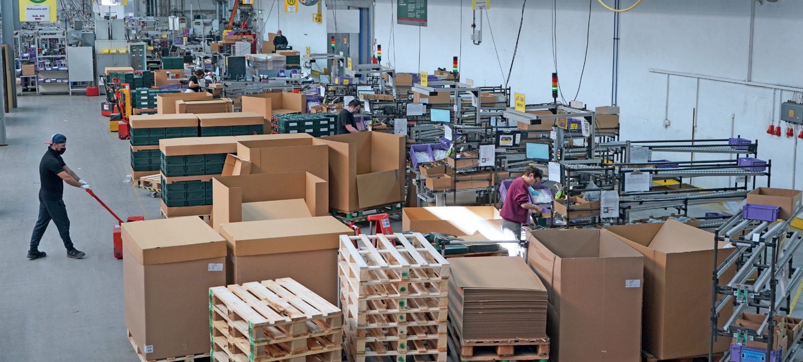
Metabo currently has seven workstations equipped with WeASSIST. More are set to follow.

After successfully passing his master craftsman's examination, a new exciting and challenging position awaited him at Metabo: As a team coordinator in assembly, he not only ensures smooth processes, but since then has also supervised various projects to increase efficiency and optimise processes. „Thanks to my own involvement in assembly, I already knew where problems could arise in the process. I can now build on this and tackle individual process steps in a targeted manner in order to permanently optimise them.“